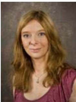
Dr. Siobhan Carroll

Students will have the option of working on a traditional, conference-length seminar paper for their final assignment, or a final pedagogy assignment that includes a syllabus and writing exercise; the course will also include a public-facing assignment in which students practice pitching and drafting a non-fiction article for a paying market.